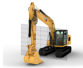
E-WALL CAB PROTECTION