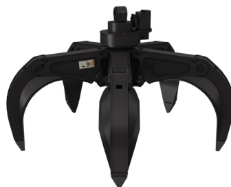
ORANGE PEEL GRAPPLES